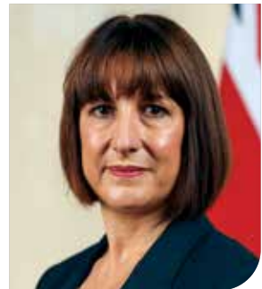
Official portrait of Rachel Reeves MP

Other significant tax increases included higher capital gains tax rates and a future reduction in inheritance tax business and agricultural reliefs. Despite the additional revenue, the Office for Budget Responsibility (OBR) projects that increased spending will mean that borrowing will still be over £70 billion in 2029/30. Not without reason does the OBR say, “...this Budget delivers a large, sustained increase in spending, taxation, and borrowing”.